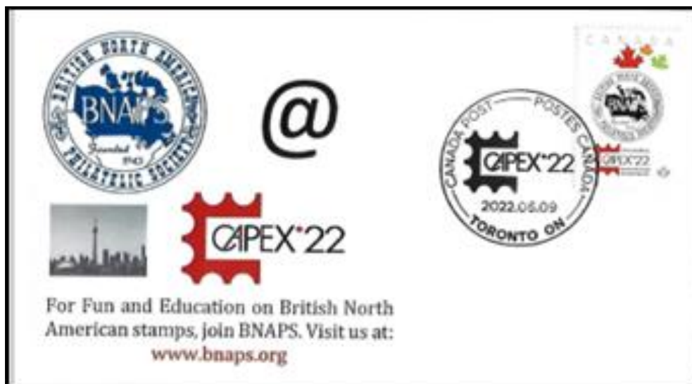
BNAPS Show cover (below) is $5.00 plus shipping

These can be obtained from dave.bartlet@shaw.ca .