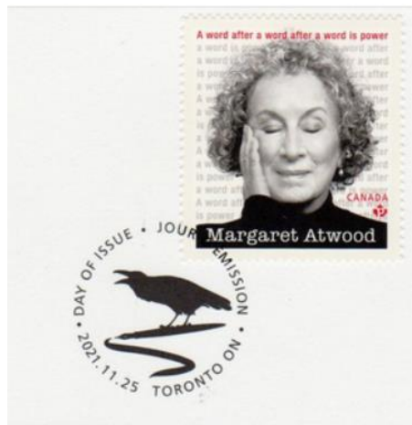
Canada Post official FDC

This is interesting: there are two varieties of first day of issue cancels for the Margaret Atwood stamp. On the left is the cancel on the Canada Post official first day covers, the ones sold at post offices and online. On the right is a cancel on a cover that I sent to the National Philatelic Centre in Antigonish for cancelling. The ink flowing from the fountain pen is thicker on the official first day cover.