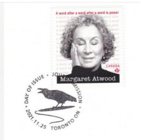
Collector's own FDC cancelled at National Philatelic Centre