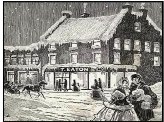
Drawing of the original Eaton's store at St. Mary's, Ontario, 1861.

“The Timothy Eaton Company was in operation for 138 years, from 1861 to 1999. During its heyday, it had department stores in over 100 cities and a highly developed mail order business. This monograph explores the company's use of postage stamps, perfins, precancels, postal stationery, postage meter machines, mailing permits, bulk mail, and revenue stamps.”