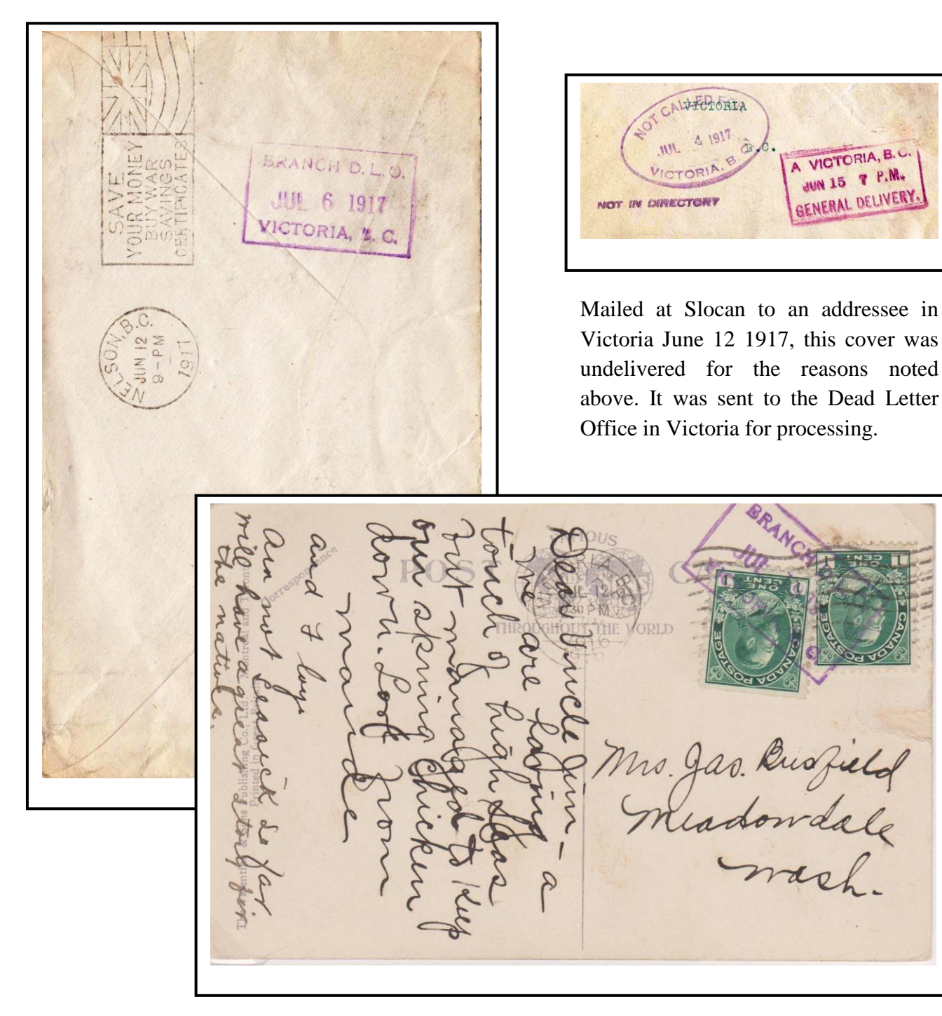
This postcard was mailed at Victoria on July 12 1916. Addressed to Meadowdale Washington, it was short paid by 1 cent. No advice or regulatory marking was appended before it was sent to the Dead Letter Office for collection of the required postage. The postage having been received, the item was forwarded to the addressee on July 19, 1916. To be continued next issue...

In June 1915 another date stamp was issued to the Dead Letter Office in Victoria. This rectangular device was only used for a short period of time between July 1915 and July 1917.