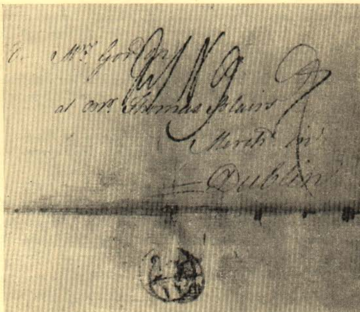
Fig. 2. Example of the Colonial Bishop's marking found on early covers.