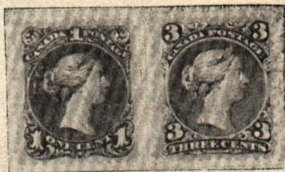
RARITIES FROM THE ROYAL COLLECTION—1c and 3c mint on laid paper.

To distinguish this collection from that formed by his father, the albums