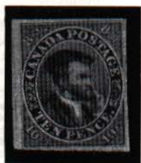
From the H. R. Harmer sale