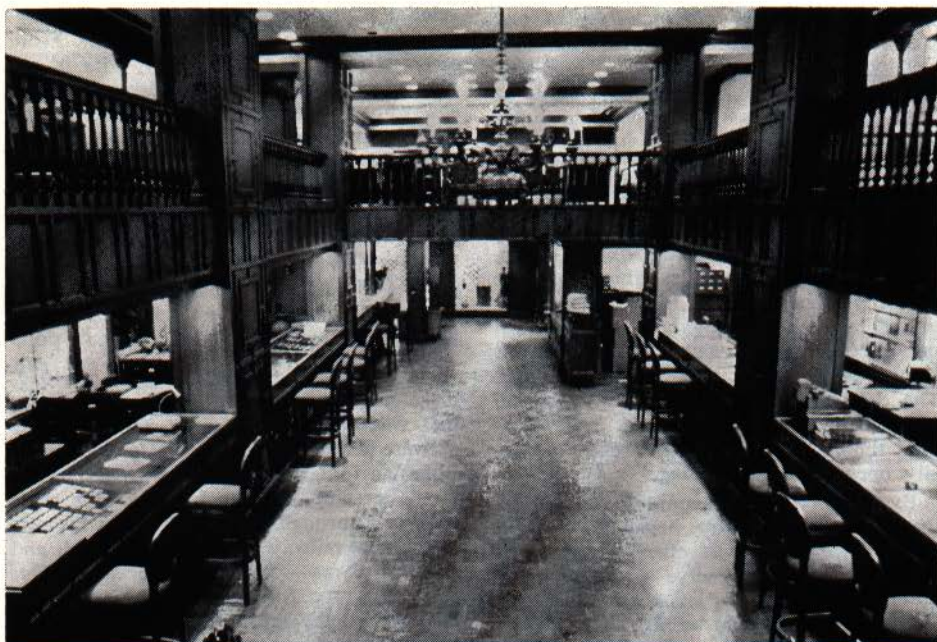
Interior view of two of our 4 floors at 3 East 57th Street