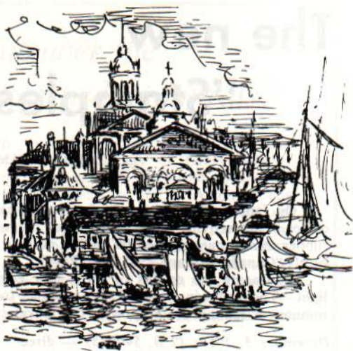
THE PORT OF TORONTO

"We are getting on very well here under Civil Service. The office is undermanned. I have written till I am sick of the subject,