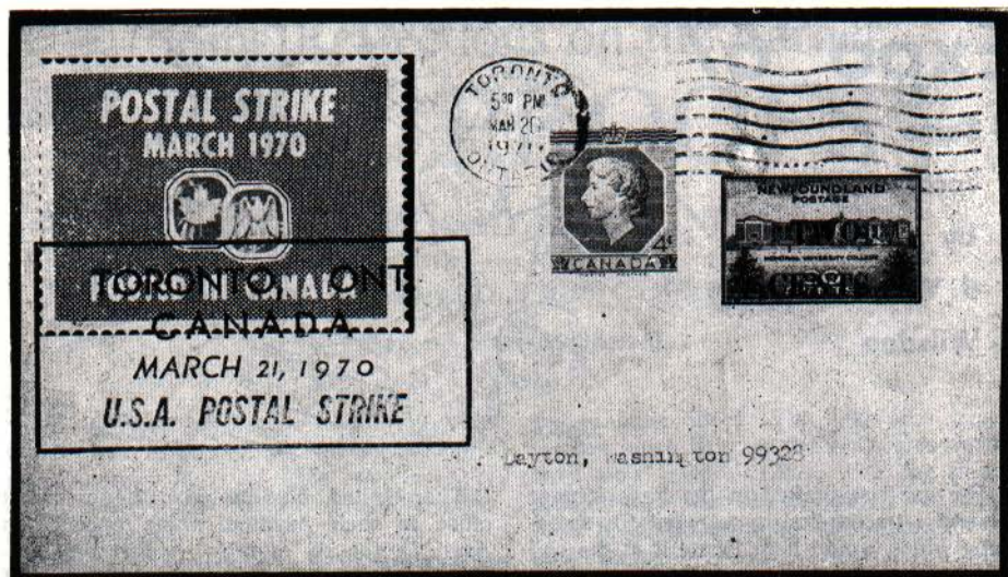
Cover sent from Toronto, Canada, where it had been privately carried from a point in the U.S. and placed in the mails during the March 1970 postal strike in the U.S. Note the strike label with applied handstamp.