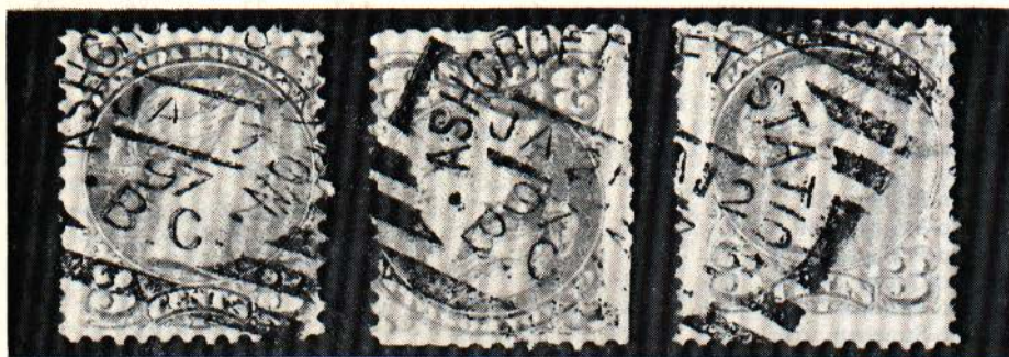
Ashcroft Station, B.C.: see last item in column