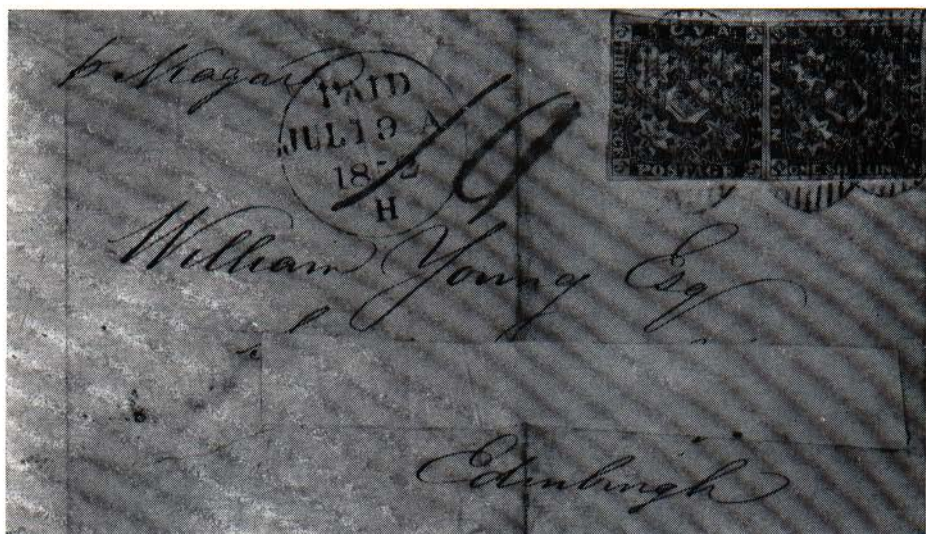
A 3d. and 1s. Nova Scotia prepaying the 1s 3d rate to the United Kingdom dated 1852. Manuscript "p. Niagara" and '10' pence sterling British claim.