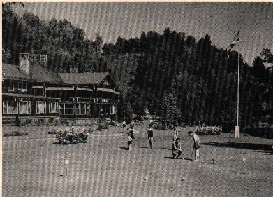
The Alpine Inn, Canada's resort Paradise in the heart of the Laurentian Mountains.