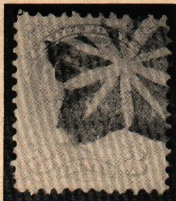
FIG. XXIII Jarrett Type 980 (Port Perry)