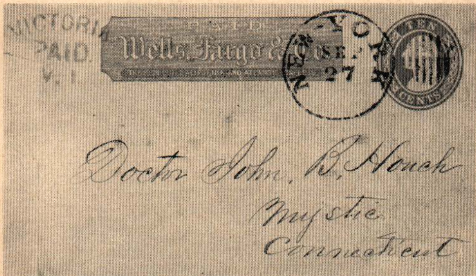
FIG. 3—Type III: Victoria Postal Frank, used in combination with the 10c envelope stamp of 1855, and Wells, Fargo & Co., type 12 frank in red. From Victoria, V.I., to Mystic, Conn., circa 1859.

Type 2— Double-lined oval, reading in three lines VICTORIA V.I./POST/*OFFICE*. Probably used during 1858-60. A woodcut. Used on the Ballou Fraser River Express envelopes of 1859-60, and on U.S. stamped envelopes of 1853-55, with and without Wells Fargo Express franks. Very rare.