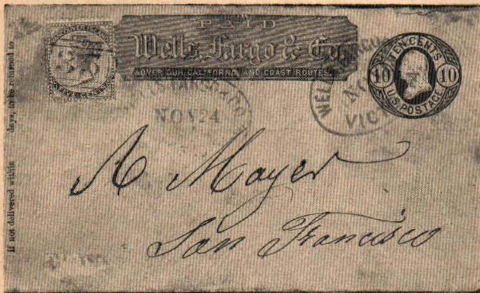
FIG. 6—The 5c Vancouver Island stamp, cancelled in blue "35" at Victoria, prepaying Colonial postage. Was the use of the 10c U.S. envelope an overpayment of U.S. postage charges to San Francisco? Circa 1866.

These same primitive mail handling methods have taken their toll, and the vast majority of covers, even those in the otherwise superb group in the Caspary collection, are badly damaged. Only a few would rate the classification of very fine.