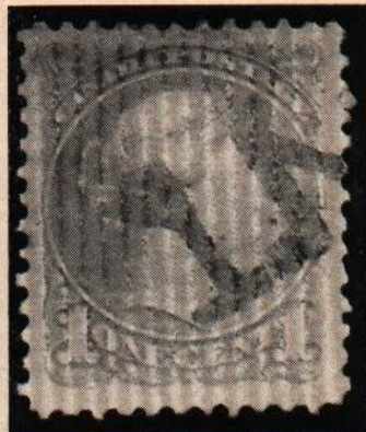
FIG. XIX Jarrett Type YK1089