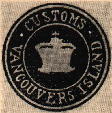
FIG. 2—Type I: Victoria Postal Frank, originating from a brass Customs Seal.

tion contains the finest group of these covers in existence and has won numerous awards at international and Canadian exhibitions, including the Grand Award at CAPEX in 1951.