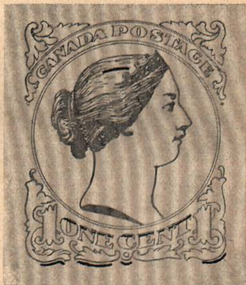
Position No. 26: "Short Strand of Hair and Re-entry."

be reconciled with the fundamental criteria. The 'strand' was considerably shorter, and accompanied by distinct evidence of strong re-entry in the lower part of the stamp.