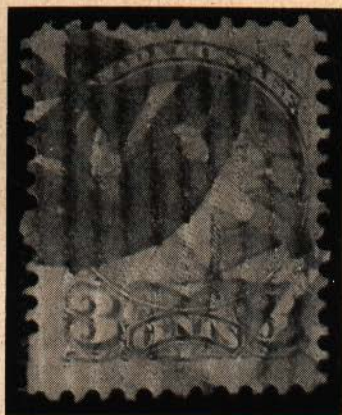
FIG. XXVI Maltese Cross (Kingston) Jarrett 1138