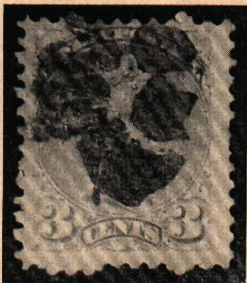
FIG. XXII Leaf Type