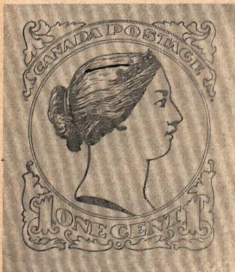
Position No. 13, "Long Strand of Hair."

IN A NOTE in TOPICS of October 1956, dealing with the plate position of this variety, I mentioned the possibility of stages, or degrees. This assumption was based upon the examination of certain copies which, even though they carried the 'Strand of Hair' characteristics, could not