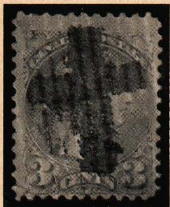
FIG. XXVII Cross