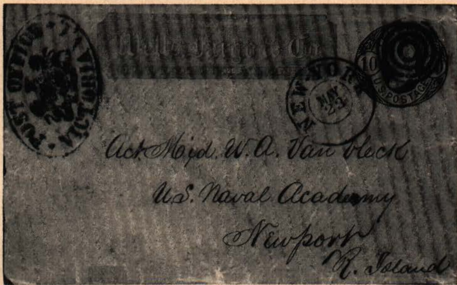
FIG. 5—Victoria Frank, indicating that the 2½ Colonial postage had been paid, used in combination with 10c U.S. envelope. Probably 1861. Type 12 Wells, Fargo Express frank in red. Victoria, V.I., to Newport, R.I.