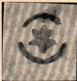
FIG. XXI Jarrett Type 885: Leaf, Otterville