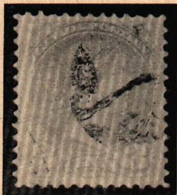
FIG. XXV Anchor