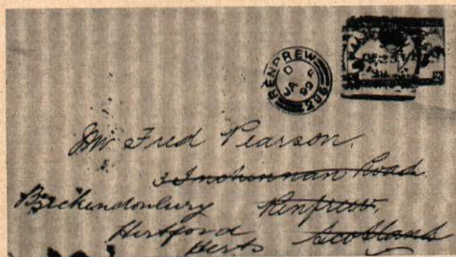
HALIFAX squared circle on Map stamp, Christmas Day, 1898. From the collection of W. M. Willcock.