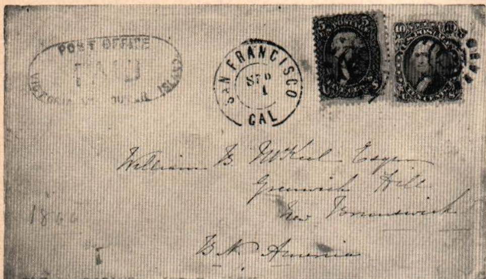
FIG. 4—Type IV: Victoria Postal Frank indicating that the 5c Colonial postage had been paid, used in combination with the 5c and 10c U.S. stamps of 1861, prepaying the U.S. rate to New Brunswick, via San Francisco.

Type 3 —(Illustrated) Also used probably 1859-60. A woodcut. The first PAID frank. Used on Wells Fargo Express, U.S. stamped envelopes of 1853-55. In blue. Very rare.