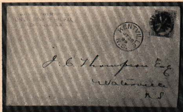
FIG. XVIII Jarrett Type 1041 (?) Kentville "K"