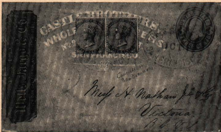
FIG. 7—An Inbound Combination Cover; circa 1866, San Francisco to Victoria.

blessed with more than your share of patience, have a good philatelic nose, and a leaning towards collecting the difficult—you couldn't tackle a better field than the Express, Postmaster's Provisional, and Combination covers of British Columbia and Vancouver Island. ★