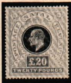
Scott #100 Cat. $3,000; Sold $7,500