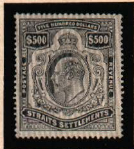
Scott #146 Cat. $2,750; Sold $4,500