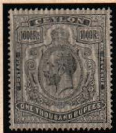
Scott #218 Cat. $1,000; Sold $1,600

And when you come to sell write for our booklet "Modern Methods of Philatelic Auctioneering" explaining clearly all the advantages of selling through H. R. Harmer, Inc.