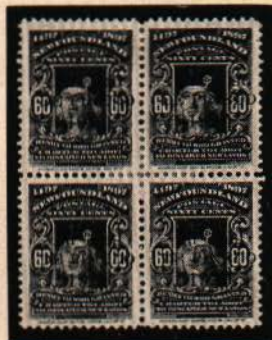
Scott #C4 Cat. $15,000; Sold $17,000

Write for free illustrated catalogues of future attractive lots being offered through Harmer's Auctions.