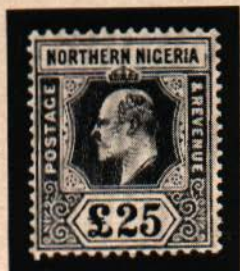
Scott #18A Cat. $2,300; Sold $6,500

We illustrate a few of the wonderful rarities which were sold by us this season. Whether buying or selling properties, both large and small, it will pay you to contact us.