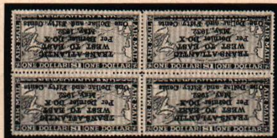
Scott #C12a Cat. $2,600; Sold $3,400