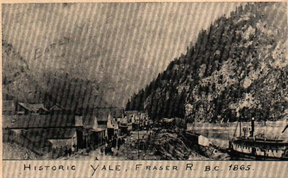
HISTORIC YALE, FRASER R. B.C. 1865.