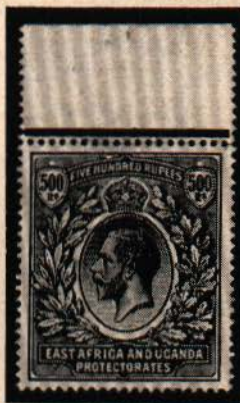
Scott #59 Cat. $1,350; Sold $2,200