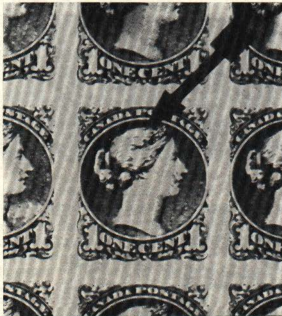
"STRAND OF HAIR"

The appearance, in the early summer of this year, of an unrecorded full pane of one hundred of the 1 cent ends the search for the exact location of the "Strand of Hair." This sheet was buried in the stock of a professional for about 30 years and is, I should imagine, unique. As students will recall, four plates of 200 subjects each of the 1 cent were laid down in 1892 and lettered "A", "B", "C" and "D" respectively above the top imprint in centre, these plates consti-