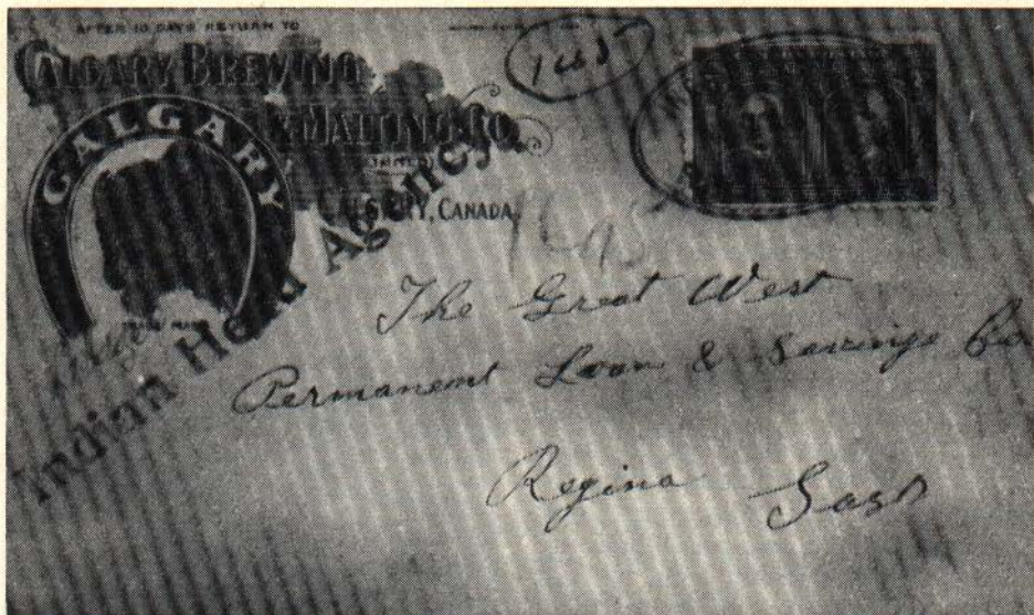
FIG. 4—The 7c Quebec properly used to prepay the postage and registration, tied with an oval "Indian Head, Sask./Nov. 16 1909/REGISTERED" cancel in purple. Illustration is bi-colored.

used here as an illustration of what may be done in the field of cover collecting with a commemorative issue—it should be remembered that there are equally interesting possibilities with other issues as well. Attractive, non-philatelic commemorative covers will add a welcome touch to your collection of stamps, and will become a centre of attraction to collector and non-collector alike. Try it! ★