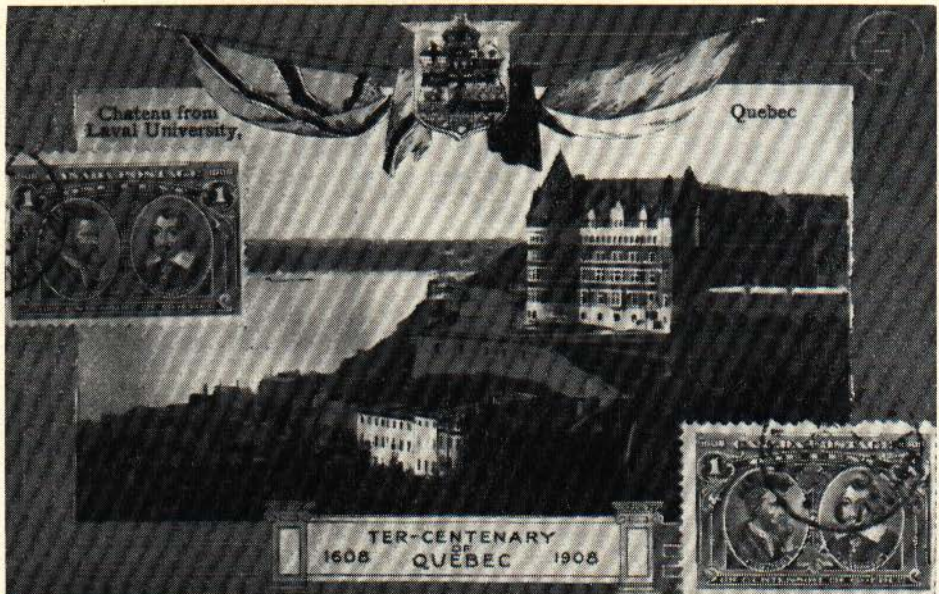
FIG. 1—An early "Maximum Card". One of the Valentine & Sons' Series of special souvenir post cards issued in honor of the Quebec Tercentenary.

The publishers of post cards were equally ambitious in their efforts to see this anniversary properly commemorated. Several of them issued one or more "official" souvenir post cards, many of which make beautiful additions to a showing of Quebec Tercentenary postage issues. These are especially desirable