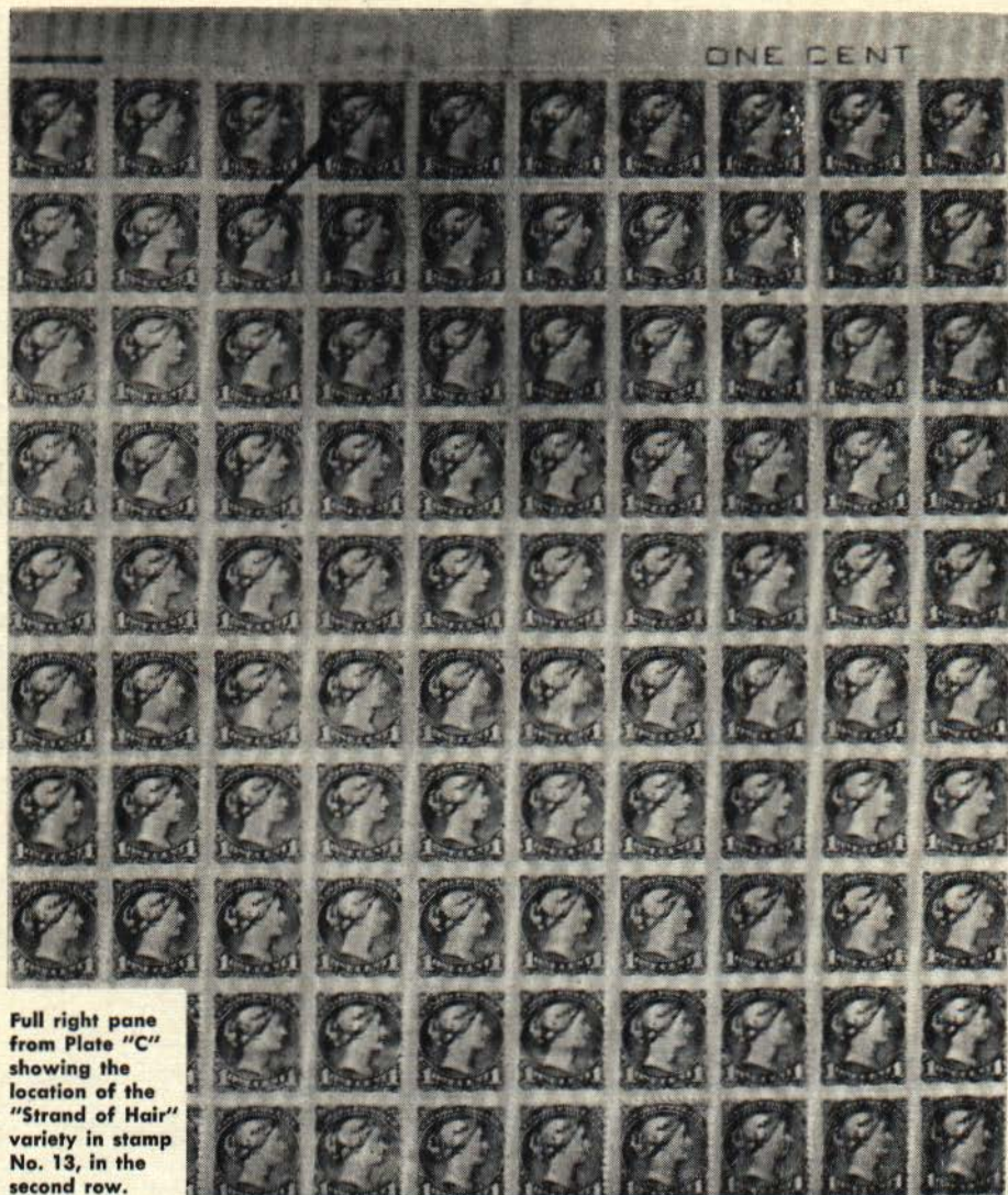
Full right pane from Plate "C" showing the location of the "Strand of Hair" variety in stamp No. 13, in the second row.

tuting the second Ottawa plates. The pane in question is from Plate "C", right pane, and stamp No. 13 shows the "Strand of Hair" very clearly.