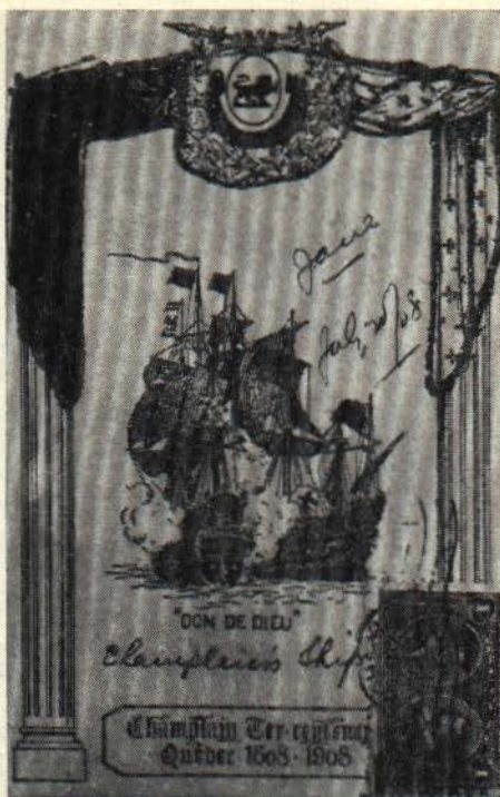
FIG. 2—Another early "Maximum Card" published by the Illustrated Post Card Co., Montreal.