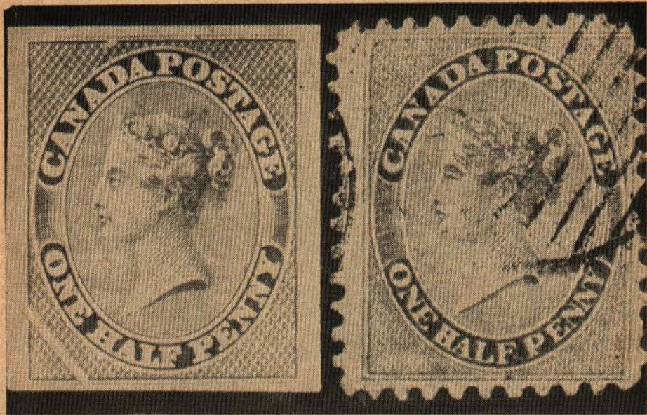
The ½d imperforate and perforate, with a genuine above left, engraved on typical "Panelli" paper. Since both represent fairly scarce stamps which are missing in most collections, these would even today deceive a goodly number of collectors, despite the thinner lettering and enlarged spacings between the upper and lower legends.