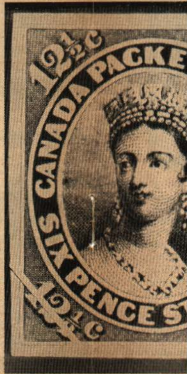
AT RIGHT—The forgery on the right, perforated 11x11, was probably engraved by Panelli.

A COUNTERFEIT is a stamp made expressly with the intent of robbing the postal administration, by using it on the mails, and with no particular thought of the philatelist. It may have the characteristics of the forgery (a brand-new production) or a fake (in the form of added or altered surcharges, increasing