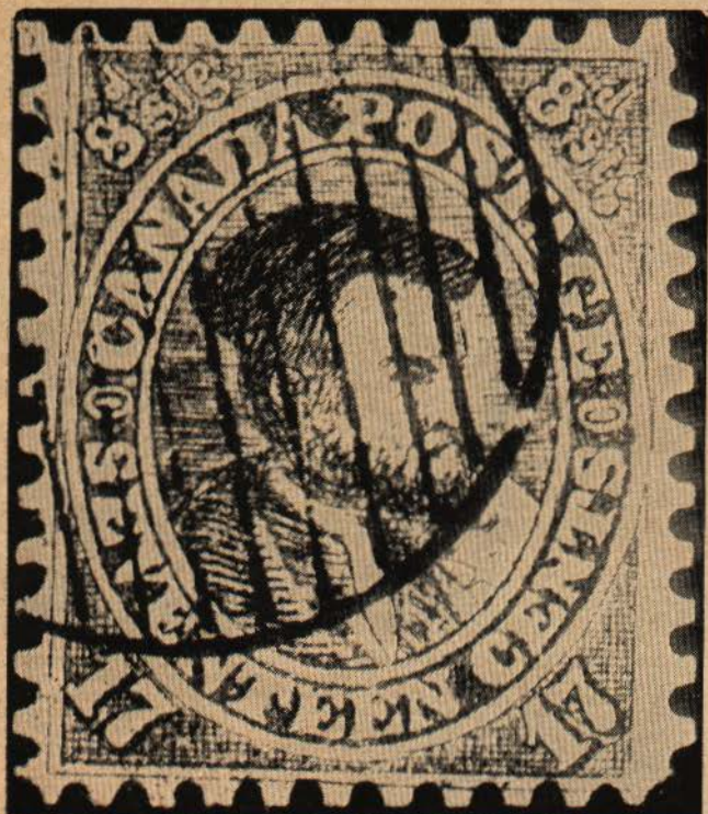
This crude label (above) perforated 10\frac{1}{2} \times 11 , and unlikely to deceive anyone, was probably the product of the Spiro Brothers of Hamburg, about 1870.