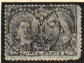
Indian Head, Assa.

The hobby of collecting early postmarks, a sideline to stamp collecting, can be both interesting and educational particularly as it concerns our own Province of Saskatchewan before 1905.