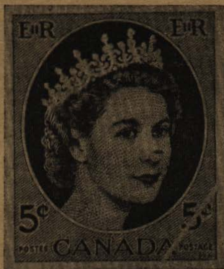
LATEST QUEEN ISSUE (See Page 111)