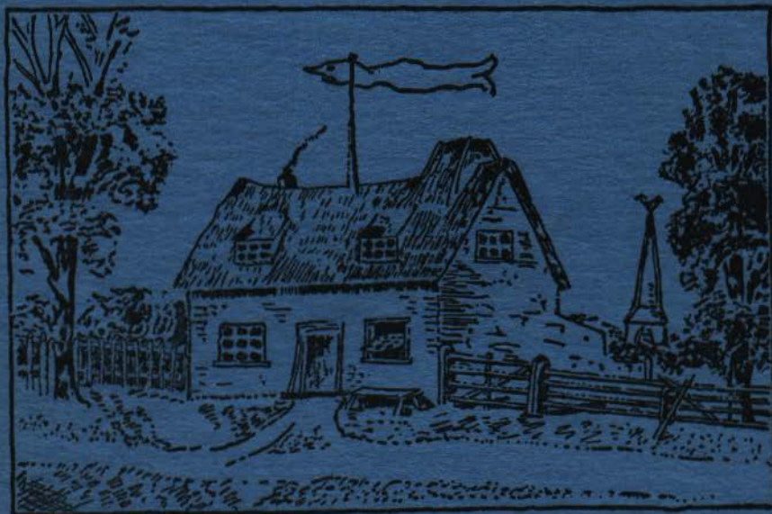
A PIONEER PRINCE EDWARD ISLAND POST OFFICE BUILT ABOUT 1780