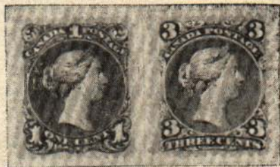
RARITIES FROM THE ROYAL COLLECTION—1c and 3c mint on laid paper.

To distinguish this collection from that formed by his father, the albums