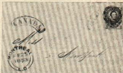
RARITY FROM THE ROYAL COLLECTION—6d on laid paper, on cover

"For the first forty years of scientific study of stamps there was never any lack of problems to be solved. Many of the primitive stamps had been engraved on plates by hand and, as no engraver can exactly duplicate a design, each unit obviously differed. Until these stamps had been plated, no one could be certain that he did