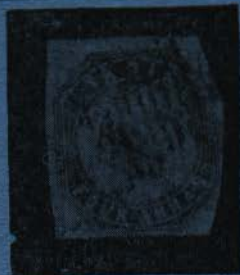
1854 4 annas with "Inverted head"

The World Famous Collection of The Classic Issues of INDIA