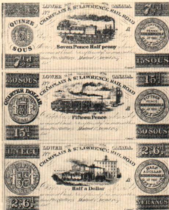
Early Railroad Money of the Champlain & St. Lawrence Railroad Company

The first railroad in Canada was the Champlain & St. Lawrence Railroad, covering a distance of 14½ miles from Lapraire (opposite Montreal) to St. John's on Lake Champlain.