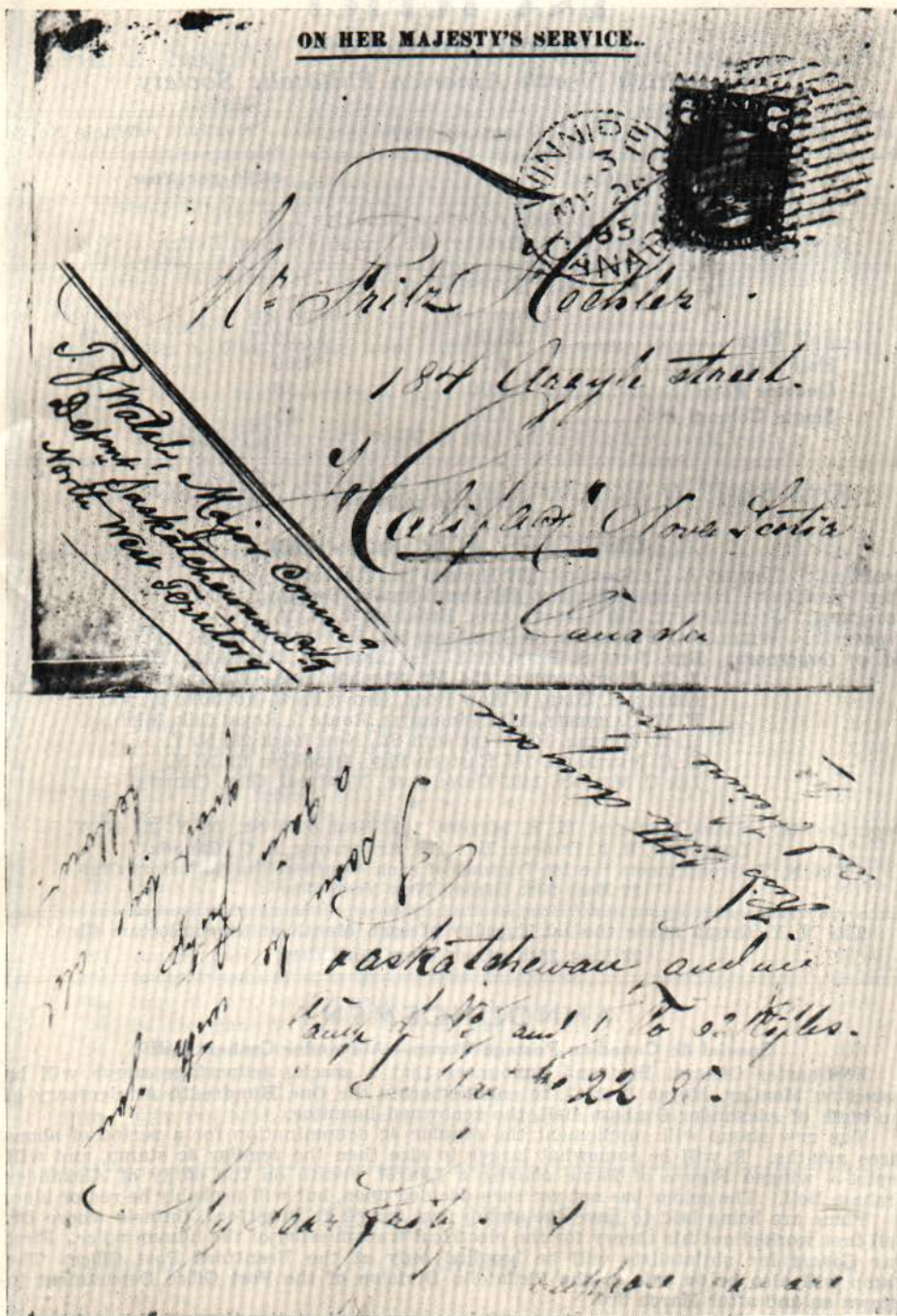
Fig. 9. Cover used during the North West Rebellion