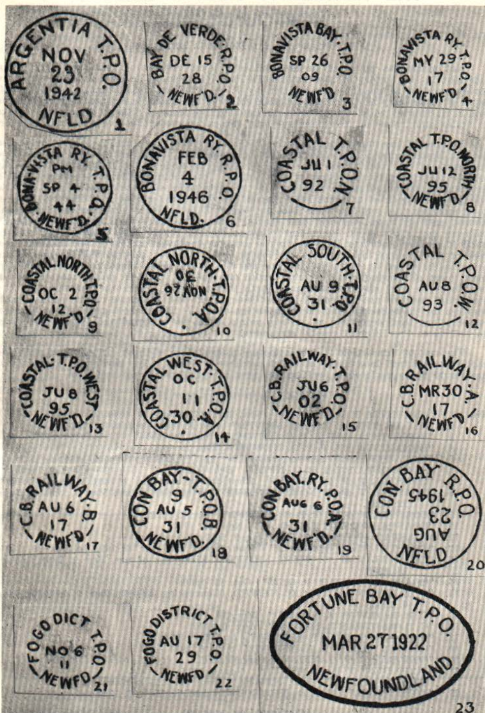
The Travelling Post Offices of Newfoundland—Figs. 1 - 23