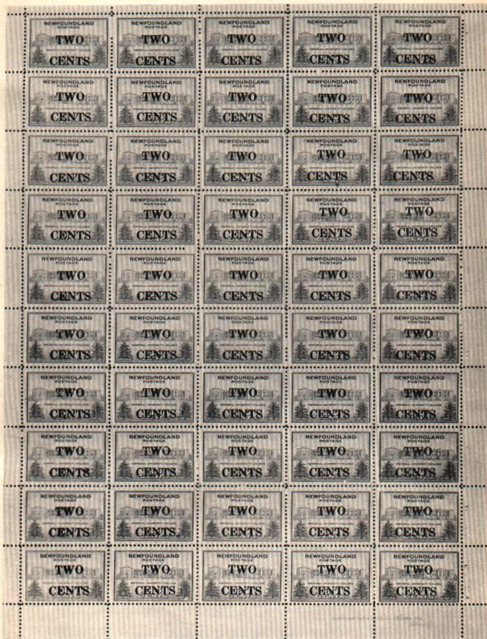
Gimbel's Stamp Department, New York