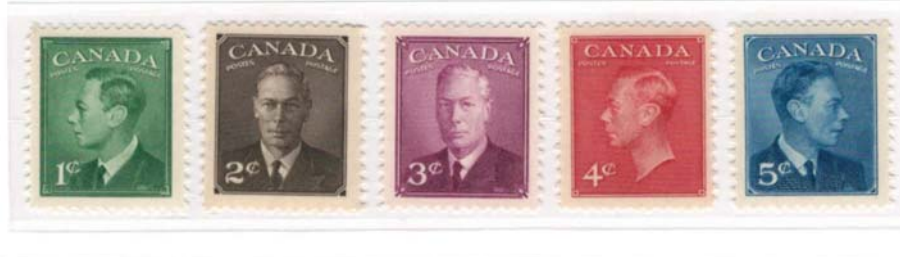
Unrevised Issue Postes/Postage omitted January 19, 1950