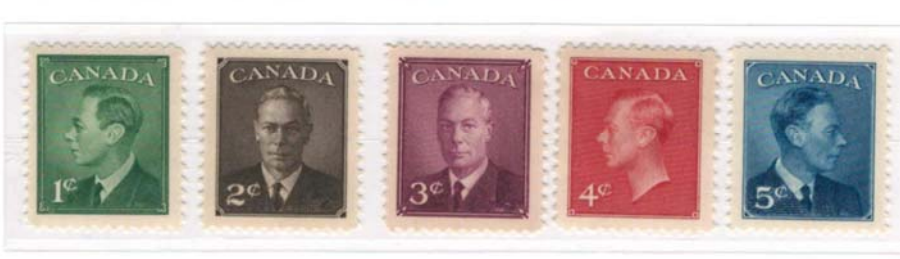
Revised Issue Colour Change July 25, 1951