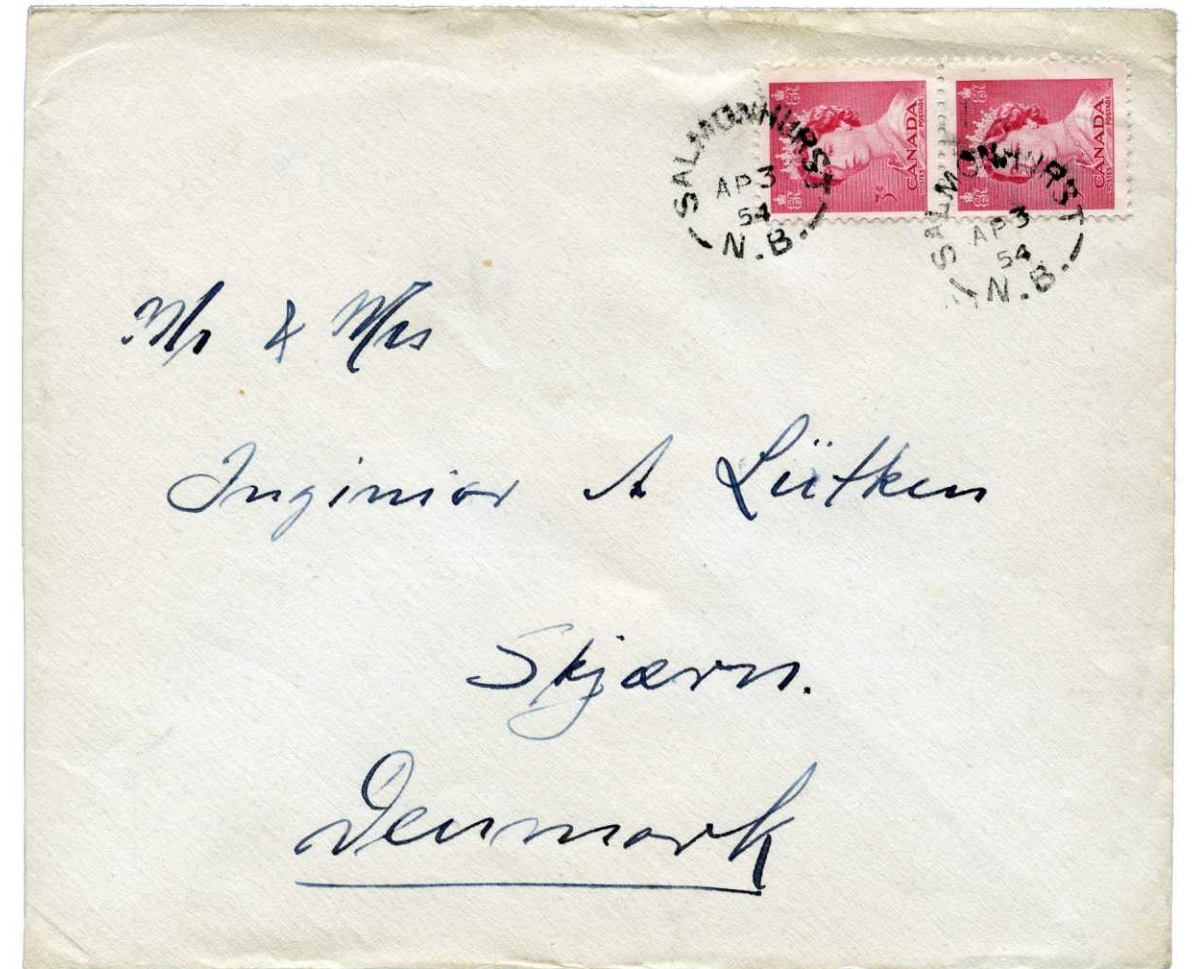
UPU letter mailed in April, 1954, required postage at 6¢ rate.

Karsh definitives, issued on May 1, 1953, were replaced with Wilding definitives on April 1, 1954 (5¢) and June 10, 1954 (1¢ to 4¢). Therefore, solo franking of 5¢ UPU letters with the 5¢ Karsh was possible until April 1, 1954, when the rate increased to 6¢ for the first ounce. From then until June 10, 1954, multiples or combinations including Karsh stamps were necessary to frank UPU letters.