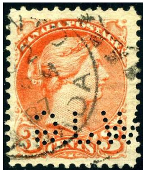
Earliest Reported Canadian Perforated Stamp, dated 1887

According to Post Office records, 80 applications have been approved since 1910. For a detailed listing, see Addendum A. The number in each year is as follows: 1910-twelve; 1911-eleven; 1912-twenty; 1913-eight; 1914-six; 1915-four; 1917-two; 1920-three; 1922-one; 1923-three; 1924-one; 1925-two; 1926-two; 1927-one; 1928-one; 1931-two. Since 1931 there has only been one approval although the regulations remain in force.