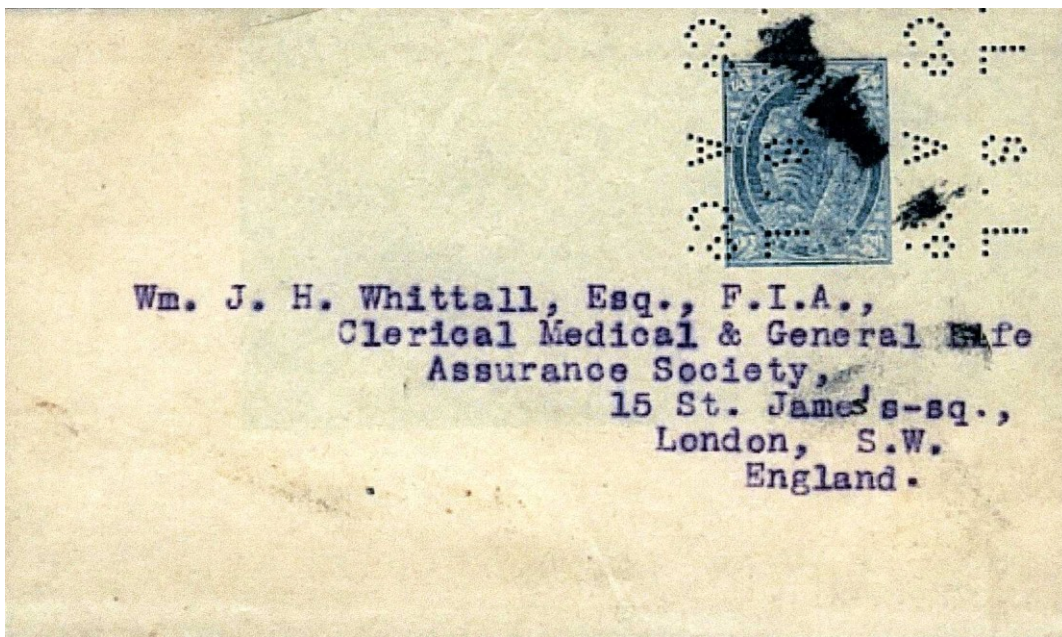
Earliest Reported Canadian Perforated Stationery.