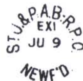
N-98 Hammer II Page 59 (N-100 AIV without outer-ring)