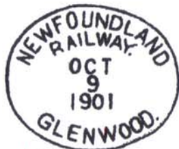
TS-180 Page 82