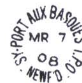
N-119 Page 77