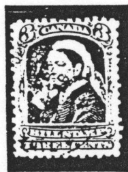
February 19, 1868