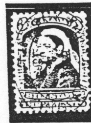
Feb 22, 1868