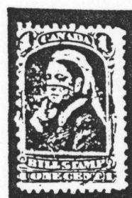
February 15, 1869