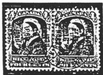
March 18, 1868