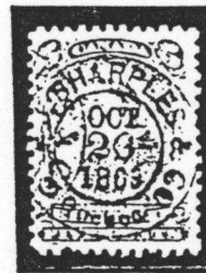
October 26, 1868