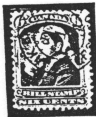
February 1, 1868