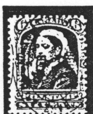
February 12, 1868