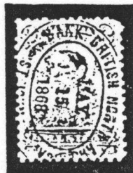
May 15, 1868