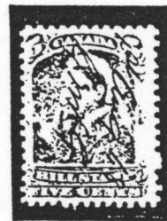
August 1, 1868