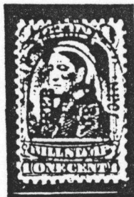
February 20, 1868