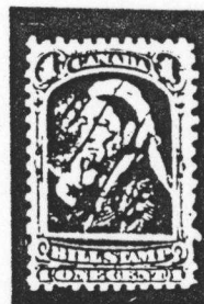
May 11, 1868