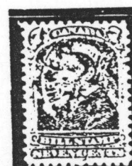
September 21, 1868