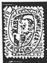
March 4, 1868