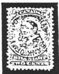
April 25, 1868