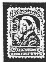
February 20, 1868