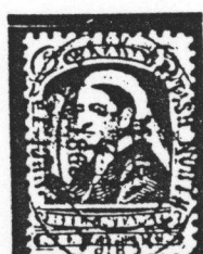
March 7, 1868