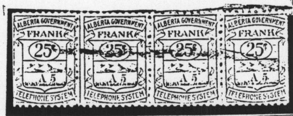
AT 1 - strip from booklet pane AT 2

Keith Spencer sends us illustrations of his copies of the Alberta Telephone Franks AT 1 - 2 - 3 - 6 also strips of AT 1 and 2 from booklet panes. How about AT 4 and AT 5 can anyone show us these?