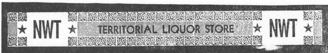
NWT 1 - black on red; 136 x 15 mm.