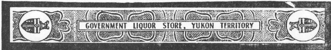
YK 2 - black design, no external border; 142 x 14 mm.