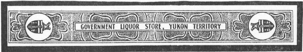
YK 1 - black design with external border; 154 x 17 mm.