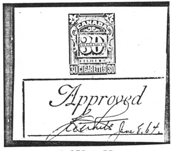
C-378 A PP