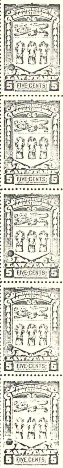
Saskatchewan Law Stamps overprinted "SPECIMEN" in the upper selvedge each stamp cancelled with a round punch