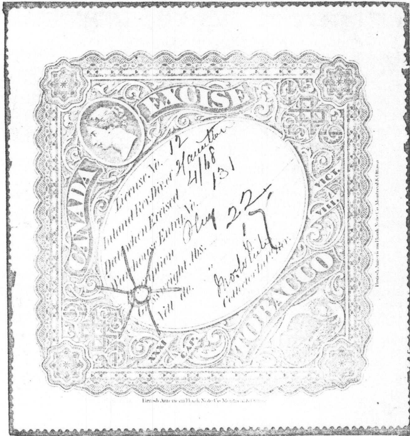
1868 PROVISIONAL ISSUE LITHOGRAPHED - UNWATERMARKED WOVE PAPER SQUARE TYPE 92 X 93 MM - PERF. 10

This issue has been surcharged "Not to cover more than 110 lbs." in 2½ mm red upper and lower case Gothic letters, reading down from left to right. There are two types of the surcharge. Type I, the two figures 1 of 110 have pointed tops. Type II, the two figures 1 have flat tops. These stamps were printed in sheets of 15 (3 rows of 5) and the two types of the surcharge appear in the same sheet and the same row. One or two of the stamps in the sheet have Montreal & Ottawa imprint, the others do not.