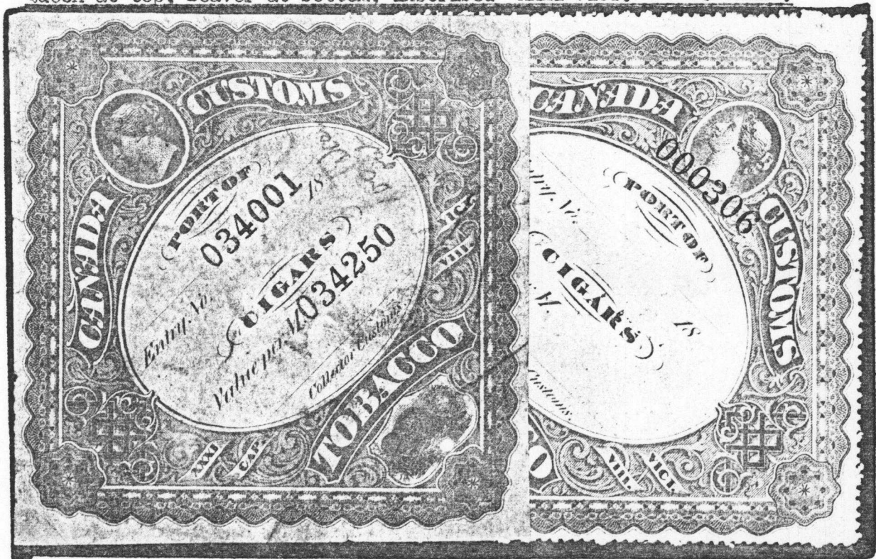
G-510 Blue, port open, imperf., 5 mm blue control nos. ② G-511 Blue, port open, perf. 10, 5 mm red control nos. ②

Queen at top, Beaver at bottom, inscribed "XXXI VICT. - CAP. VIII".