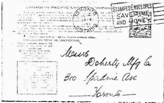
Figure F 19