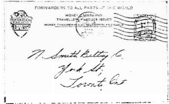
Figure F 20