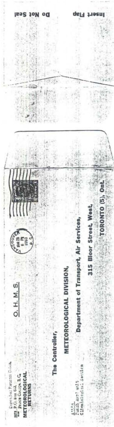
21. 2272 (over) 9-48 / METEOROLOGICAL / RETURNS // O.H.M.S. // The Controller, / METEOROLOGICAL DIVISION, / Department of Transport, Air Services, / 315 Bloor Street, West, / TORONTO (5), Ont. // Insert Flap Do Not Seal (used MAR 28, 1960 but PG has Dec 7 1959) - unglummed rounded flap at right