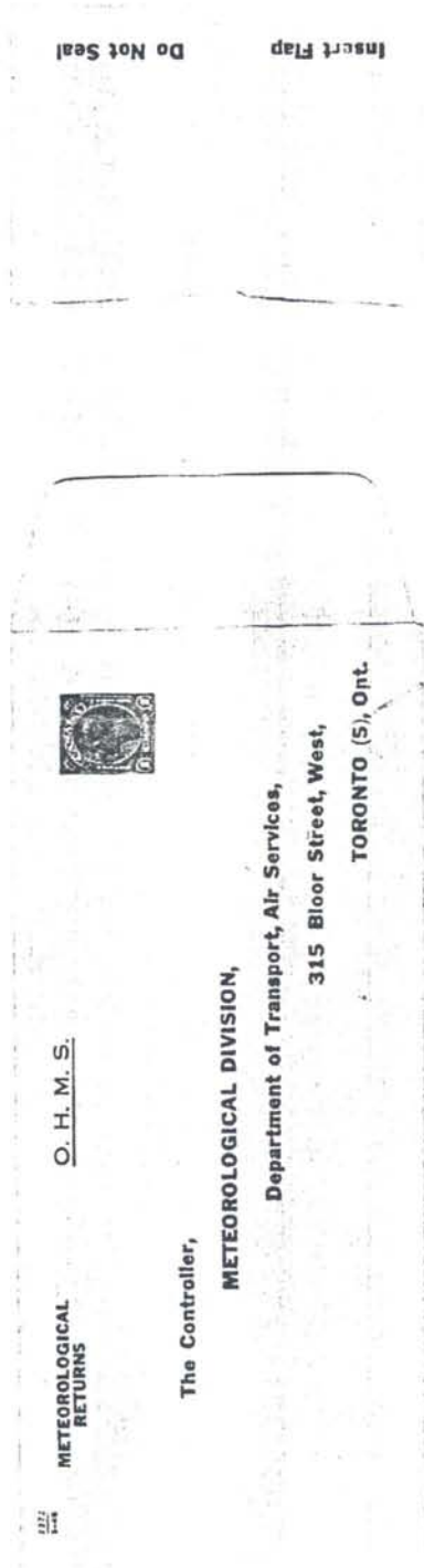
20. 2272 (over) 5-46 / METEOROLOGICAL / RETURNS // O.H.M.S. // The Controller, / METEOROLOGICAL DIVISION, / Department of Transport, Air Services, / 315 Bloor Street, West, / TORONTO (5), Ont. // Insert Flap Do Not Seal - unglummed rounded flap at right