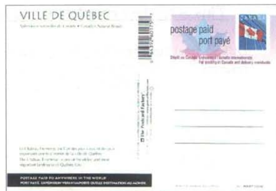
# VQ 102 front and back