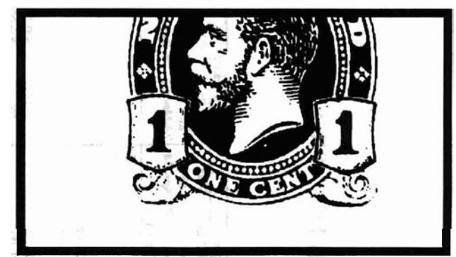
die I, type A

Subsequent to receiving Horace's photocopies, Bill Walton has examined his own copies of Newfoundland P13, and found the left and right serifs vary slightly from copy to copy. The copy of die I, type B shown has a longer left serif and a shorter right serif than is found on most copies. Bill agrees these interesting differences probably reflect positional characteristics in the die I plate rather than a different die. The differences are noteworthy, but probably the two types are not separate listable varieties for the Webb's Catalogue.