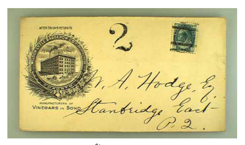
Stamp on cover