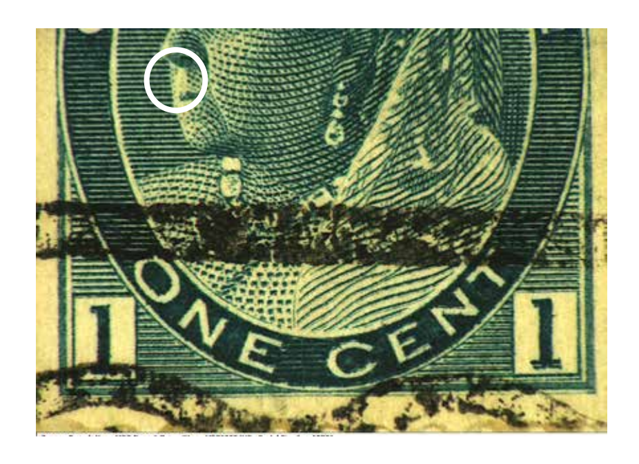
Enlarged view of variety