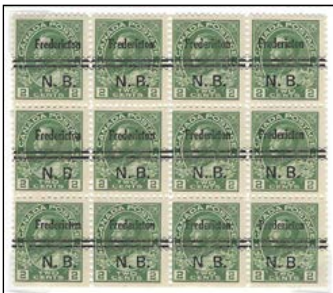
Figure 4. Believed to have been printed from plates 219 to 223. This block of 12 is from the same sheet as the one shown as Figures 1 and 2.