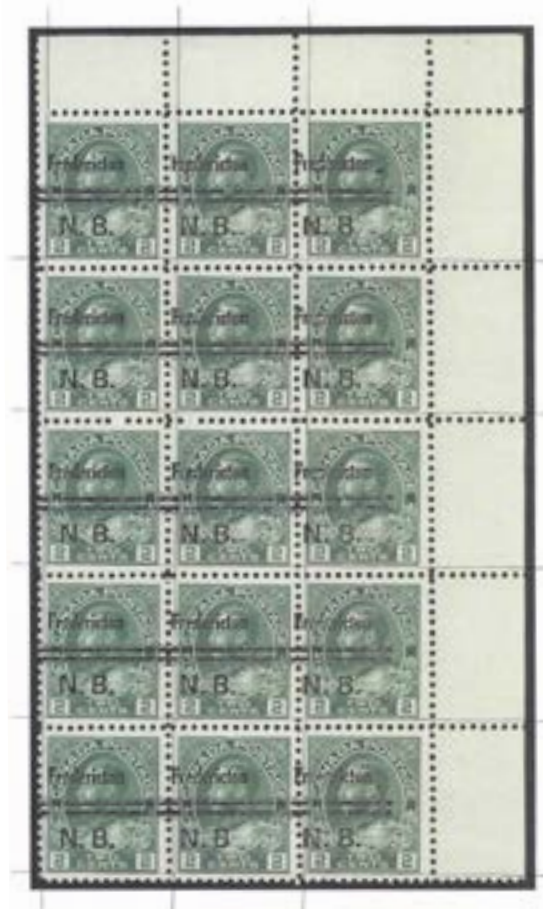
Figure 1 (above). With the help of the black lines at the top and right side, one can see that the stamps in the same row are shifted upwards as one goes from the left column to the right. Stamps in the same column are shifted to the right as one goes from the top row to the bottom row.

2. A siderographer reproduces original engravings on metal plates used to print banknotes, bonds, and other securities, using gravers' handtools and machines.