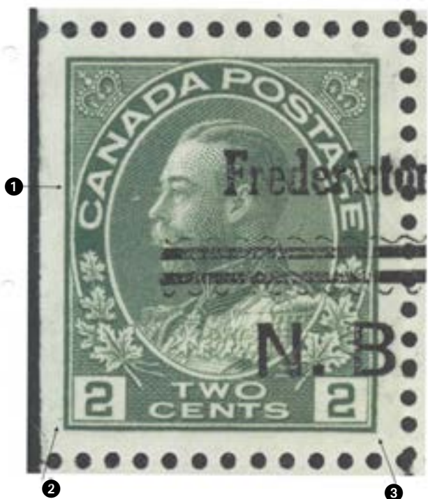
Figure 2. All the blocks are from a dry printing on the re-engraved die. A characteristic of the plated from the re-engraved die is the slight extension of the bottom frame into the right margin (arrow 1 in the illustration above). Another characteristic of many re-engraved die plates is a small dot in the left margin opposite the bottom of the left numeral box (arrow 3). This characteristic is specific to Marler's Design Type RE3 (page 330). Thus the blocks must come from plates 219 to 223.