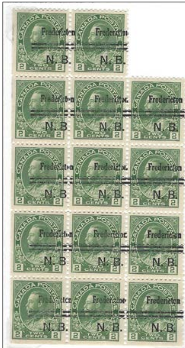
Figure 3. Believed to have been printed from plates 219 to 223. This block of 14 is from the same sheet as the one shown as Figures 1 and 3.