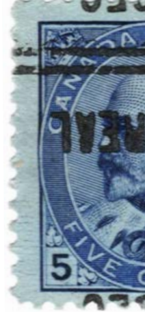
Left-hand section of 91i with inverted Montreal precancel shown at 600 dpi. Hair lines appear in lower left margin.

I made two scans of the stamp in question, one at 300dpi and another at 600dpi. The latter (image at right) shows the hairlines nicely, strongest at lower left. It was marked on the back as a cracked plate. Has anyone discovered any Unitrade #91 as normal or precancel with this variety?