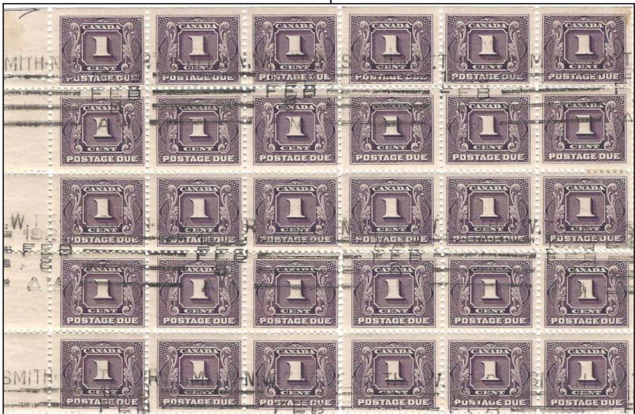
1¢ Canada postage due (J1) precancelled with Fort Smith roller cancel

February 8, 1928 or 1929. The device was proofed on March 10, 1926 so either date would work, but I suspect it is probably 1929 when the flights down the Mackenzie Valley had begun. These stamps probably paid postage due on parcel or bulk incoming mail, I just got an entire sheet of these stamps cancelled January 28, 1929 on eBay."