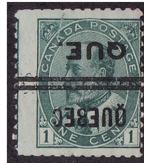
Enlarged to 150% of furnished image

I sure could use some hel in categorizing my first scan: MONCTON 1-149. I started out by calling it bar variety D-2. This did nit quite fit the bill as the bottom bar is nt quite borken all the way, and I don't know what to make of N.B. as it looks more like a partial "N" and a partial "O"