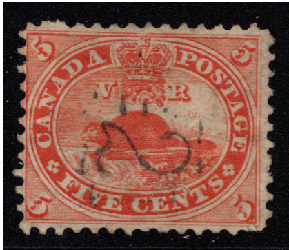
Enlarged to 200% of furnished image

Our readers might be interested in this: the 7th edition of the "Standard Precancel Catalogue" lists Montreal forerunners but not in the beaver stamp. Here is one I recently acquired. Can anybody comment on its scarcity?