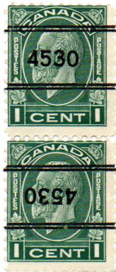
Shown at 100% of furnished image

I have a scan of a Toronto tete-beche precancel. I have not come across this before as all blocks and sheets I have seen are printed the same way, either up or down.