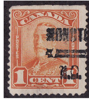
Enlarged to 150% of furnished image

Have been busy sorting through my horde of precancels and found a number of unlisted Precancels as well as varieties.