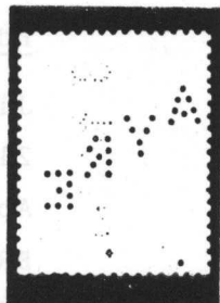
Illustration 1 Scott # 190

Since that time 2 additional copies have come to my attention. on Scott # 254 and # 257. The latter provided a clue. Ill. 2