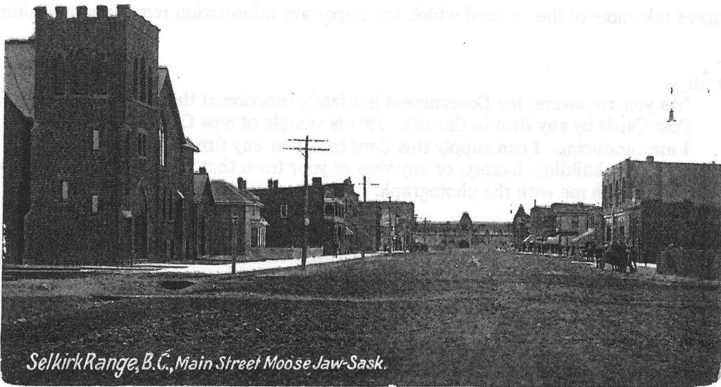
Selkirk Range, B.C., Main Street Moose Jaw-Sask.