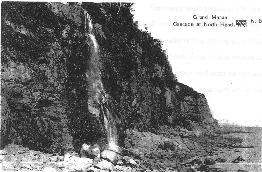
Grand Manan Cascade at North Head, N. B.