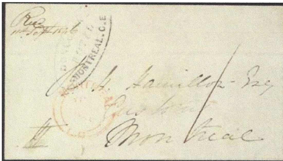
Lot 113 listed as Canada's earliest hotel advertising cover

Lot 113 is a stampless envelope dated Montreal 11 September 1845, with a Donocana's Hotel OVAL advertising stamp in the upper left corner. It has a manuscript "1" (for letters picked up at the post office). It was listed as the EALIEST RECORDED CANADIAN STAMPLESS HOTEL ADVERTISING COVER . It was estimated at $350 and realized $325