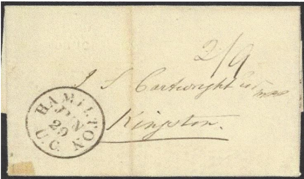
Early Embossed John Roper Drugs cover

Lot 111 was described as a folded letter from Hamilton to Kingston dated 29 June 1841 with an EMBOSSSED John Roper / Drugs & Groceries / Caledonia, CW advertising oval in the upper left. It was written up as the earliest recorded embossed stampless Canadian advertising cover . The embossing is very difficult to discern in this newsletter but evidence is visible when you look closely. This lot was estimated at $350 and realized $160