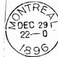
Dater Hub "B"