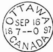
Dater Hub "Z"

Between October 1896 and January 1897, the dater hub can be found with a blank after the hour rather than the "0".