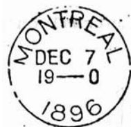
Dater Hub "A"