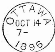
Dater Hub "X"