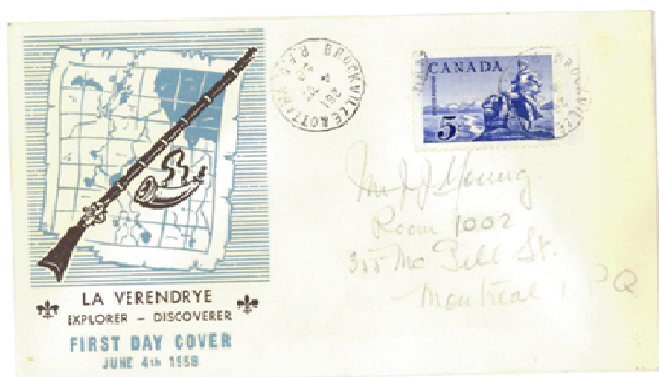
Fig. 1—CANECO Cachet w/RPO Cancel