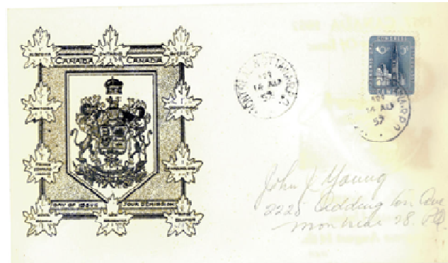
Fig. 4—Unknown Cachet w/RPO Cancel