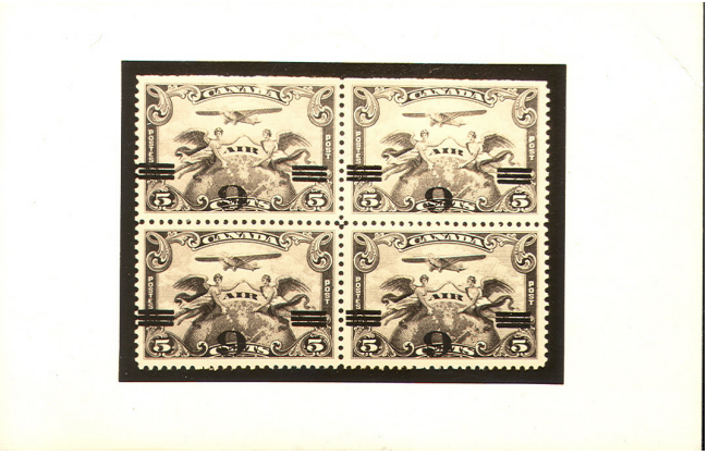
Front of card with photo of C3a Block of

The answer is on the other side of the card.