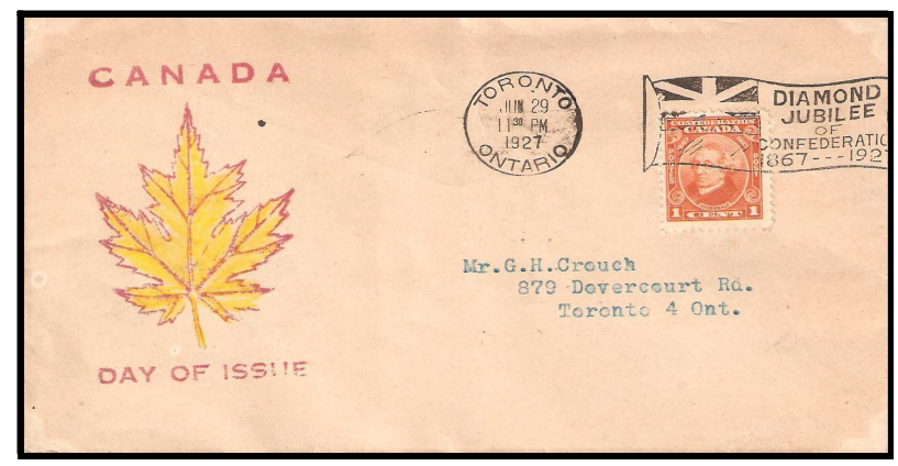
Hand -coloured "Crouch" Confederation First Day Cover with rubber stamped cachet

The cachet consists of a rubber -stamped red maple leaf which is hand-coloured with yellow inside its borders. The text shows "CANADA" above the maple leaf and "DAY OF ISSUE" beneath it. The cover is addressed to Mr. G.H. Crouch of Toronto. There is a single 1-cent stamp (Scott 141) so the 2-cent rate for domestic mail is underpaid by 1 cent.