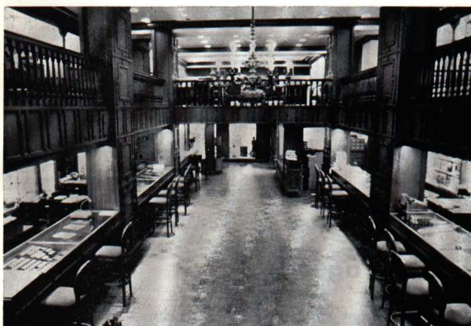
Interior view of two of our 4 floors at 3 East 57th Street