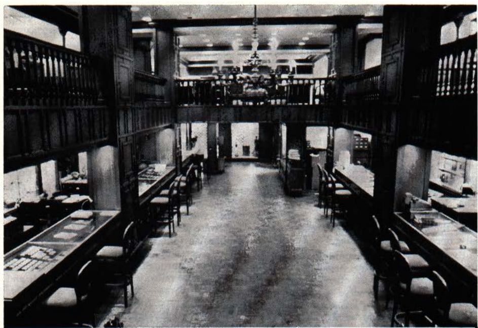
nterior view of two of our 4 floors at 3 East 57th Street