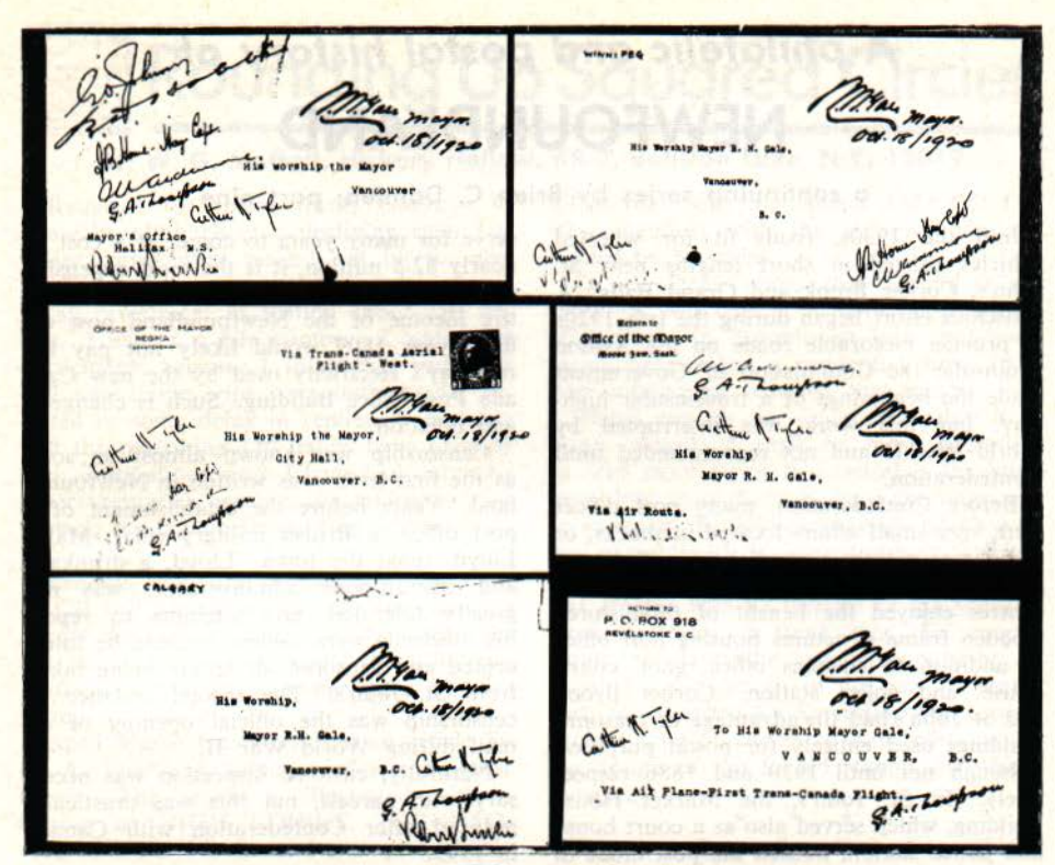
Six covers from the flight, mailed from various points

them to land there and F/L C. W. Cudamore flew in from Moose Jaw in another DH9A and continued on to Calgary.