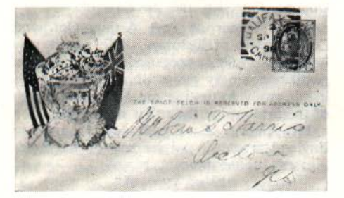
112 / BNA TOPICS / MAY, 1966