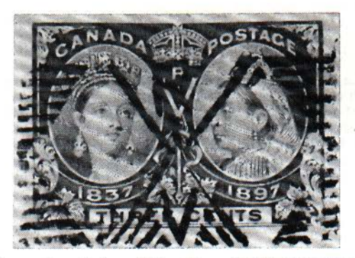
Fancy Cancels from Notre Dame St. West, Montreal (See page 322)