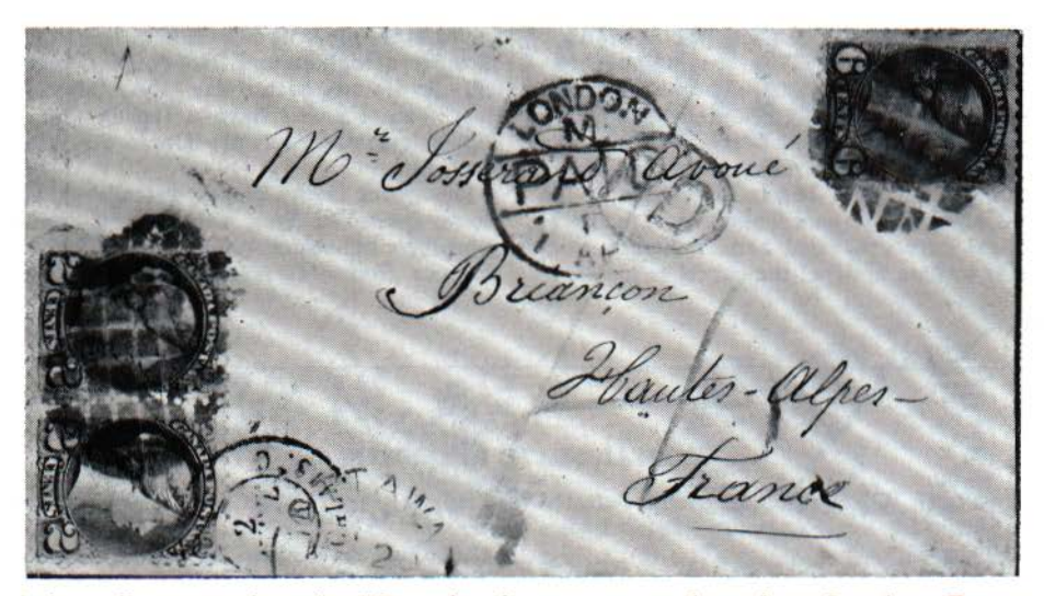
A 6c small queen and a pair of 2c paying the postage on a letter from Canada to France.